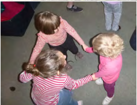
Laughter, friends, art, sand, music & play Are all part of a Briar's kindy day