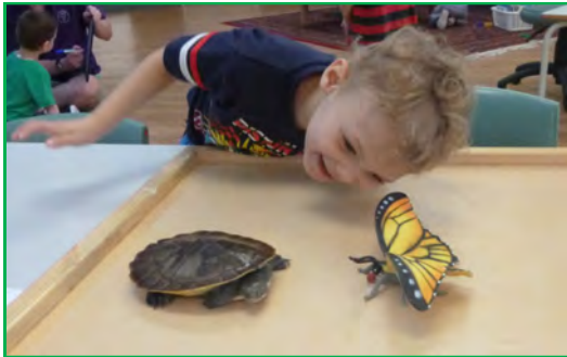
We have said Goodbye to the green tree frogs and Hello to Talloulah the Turtle