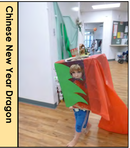
Chinese New Year Dragon