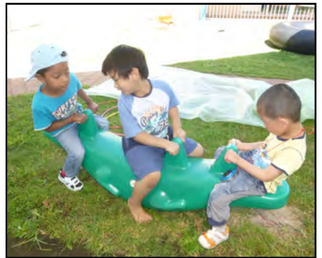
One of the stories we are sharing is "10 Green Geckos"

If you have any PVC pipe cut offs or metal buckets laying around, we would love to take them off your hands.