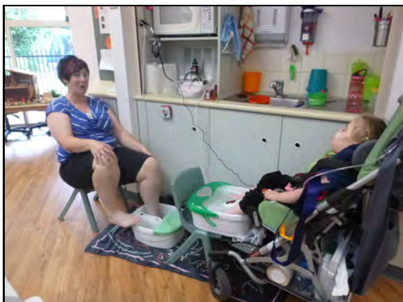
Mum & Daughter enjoying a well earned foot spa together